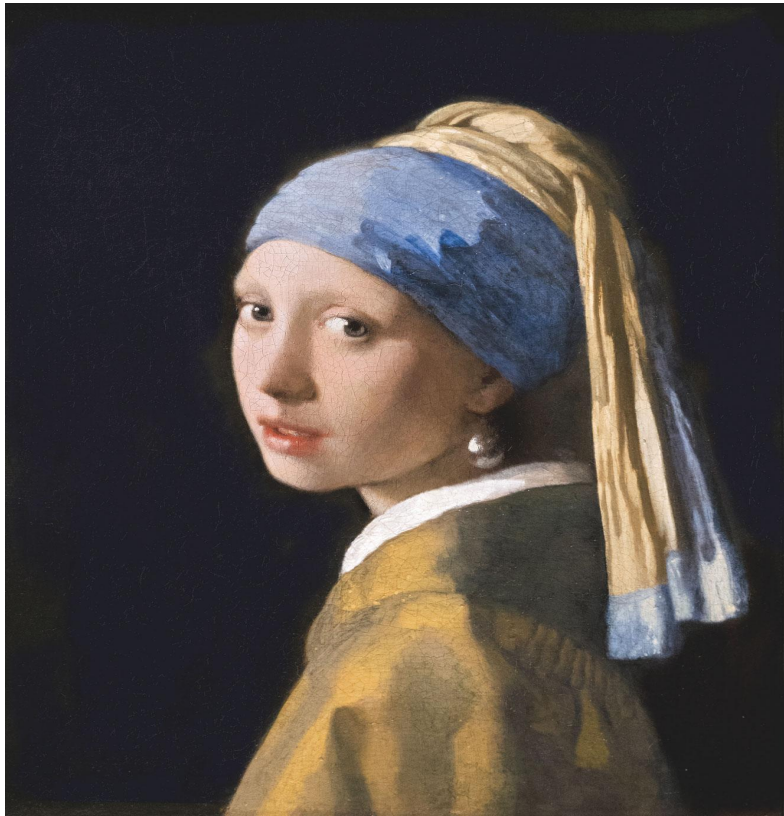
Girl with a Pearl Earring (1665)

https://www.britannica.com/topic/Girl-with-a-Pearl-Earring-by-Vermeer