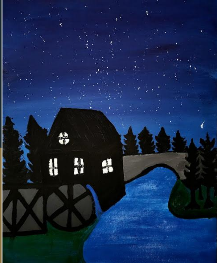
Starry forest (2021)

https://love2justin.weebly.com/project-4--night-scape-painting.html