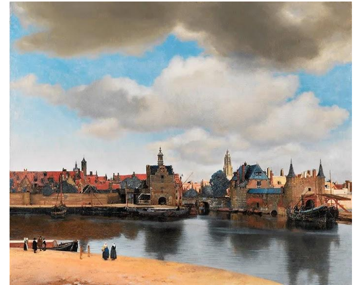
View of delft (1660-1661)

The Girl with a Pearl Earring shows a dark place representing the dark times, however with the dark, the bright woman that shines in the painting as if her brightness shows the bright future the Dutch were looking forward to. The View of Delft shows a peaceful cityscape of Delfts representing the Netherlands winning the 80 year war showing not only freedom but also peace.