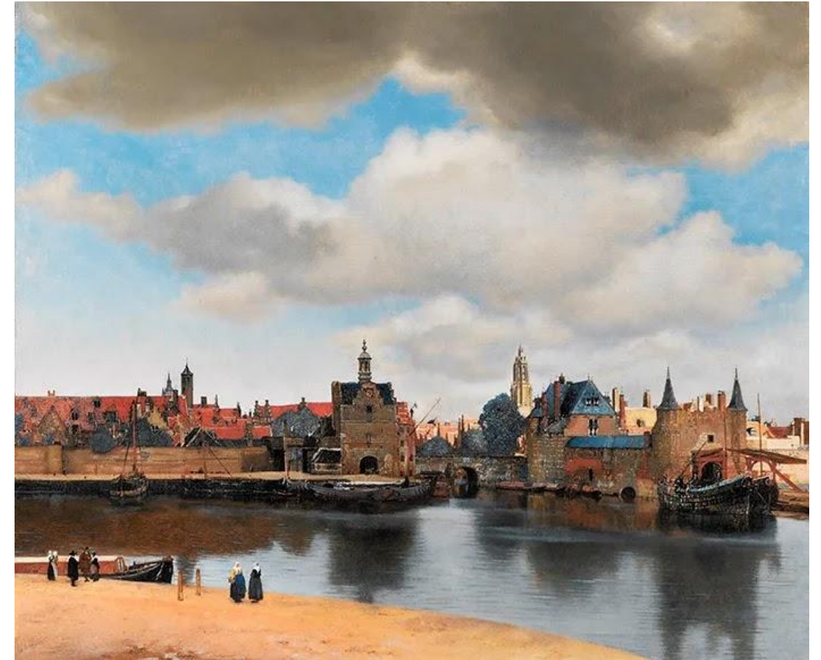
View of Delft (1660-1661)

The Purpose of the View of Delfts is an artwork that gave an important message. Vermeer painted this artwork to send message of peace and their freedom. The Function of the painting wasn't showing how the people felt and was hoping during the 80 year war like how Girl with the pearl Earrings was representing but its showing how the people felt after winning the 80 year war from 1568-1648 with having their freedom and is finally at peace.