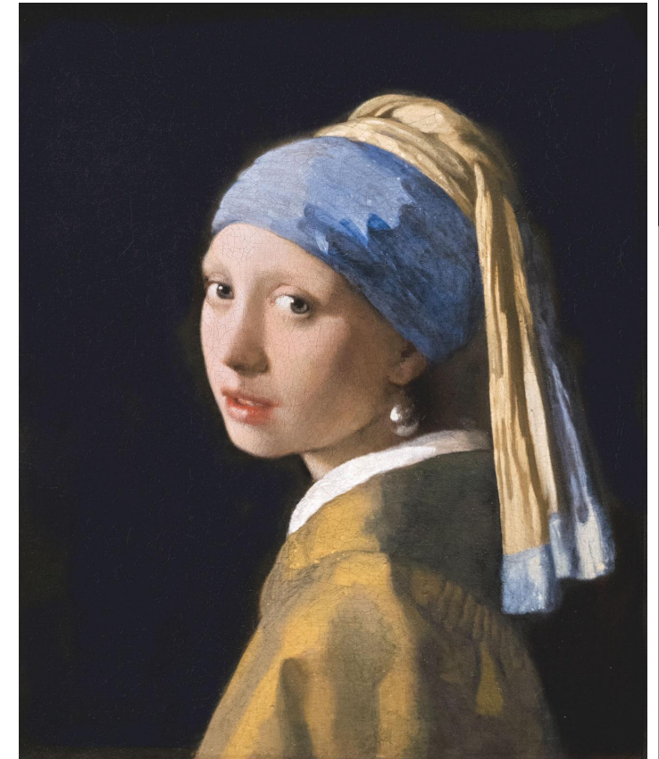
Girl with a Pearl Earring (1665)

Although both the Boy with a Basket of Fruit and Girl with a Pearl Earring do share a lot of similarities with each other. They also have a lot of differences too. Other than their opposite genders, one thing I notice about these two paintings is the expressions in both the self portraits, the Girl with a Pearl Earring expression is surprised by something and Boy with a Basket of Fruit expresses sadness. As I mentioned before, the Boy with a Basket of Fruit expresses sadness, fear and hopelessness but the Girl with a Pearl Earring shows Hope and peace for the future. Another thing I've notice is the clothing type. In the Girl with a Pearl Earring, the lady's golden jacket covers her shoulder and almost her whole neck as well and also her blue and golden turban covers the top of her head, not knowing the color of her hair while the Boy with a Basket of Fruit, his robe is hanging off his shoulder and the portrait shows the boys hair unlike the lady.