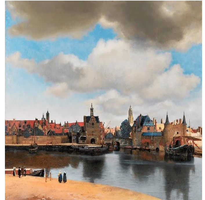
View of Delft (1660-1661)

The Boy with a Basket of Fruit and View of Delfts are two different paintings that share some similarities with each other. For starters, what I notice both about the paintings is that they share Baroque art movement. Another thing I notice is that the fruit basket is full of different bright and colorful fruit similar to the View of Delft. Even though the painting doesn't show fruit like the Caravaggio's painting, it is bright and colorful all around, it even shows a shadow in the lake like how the there is shadows shown in the background of the Boy with a Basket of Fruit.