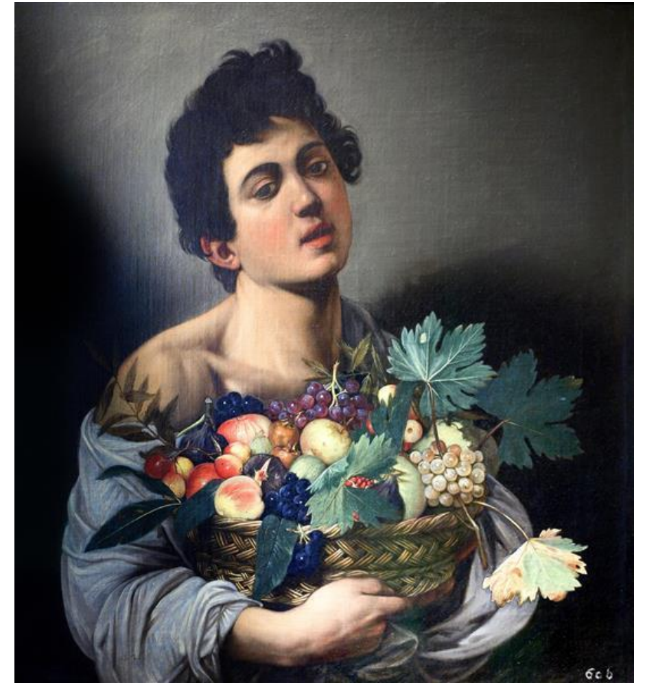
Boy with a Basket of Fruit (1593)

The Boy with a Basket of Fruit shows a greyish dark place however with the greyish dark room shows a Boy carrying a fruit basket. The boy illuminates by a strong light entering the room from outside of the paintings frame but with that, the boy expression shows a tired but sadness look on his face. Boy with a Basket of Fruit painting is representing the London plague in 1592 that killed over 15,000 people.