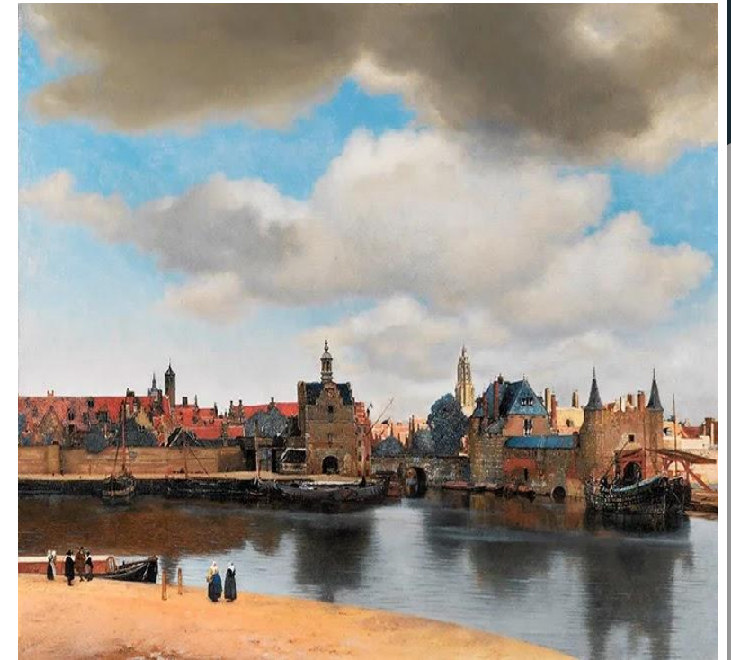
View of Delft (1660-1661)

What's different about these 2 is the theme. View of Delft shows a small beach on the bottom of the painting with a river and across the river is a small town that all takes place during the day, this scenery is different from my work because my painting takes place out in the woods with a house, watermill, and trees surrounding the area at night, both scenery are both different from each other.