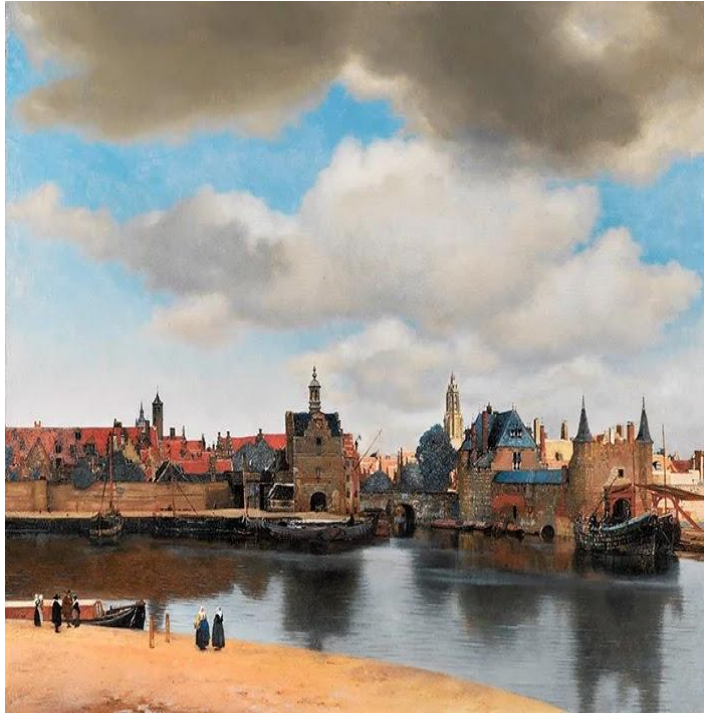
View of Delft (1660-1661)

https://colourlex.com/project/vermeer-view-of-delft/