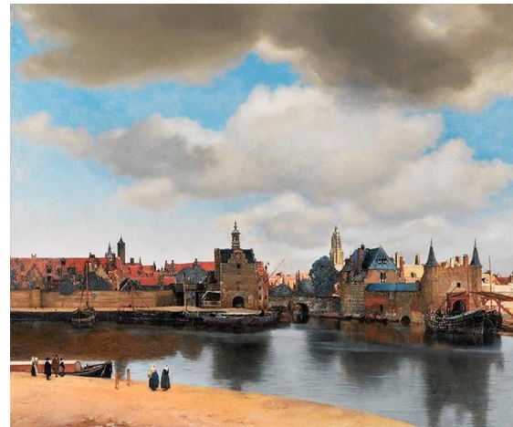
View of Delft (1660–1661)