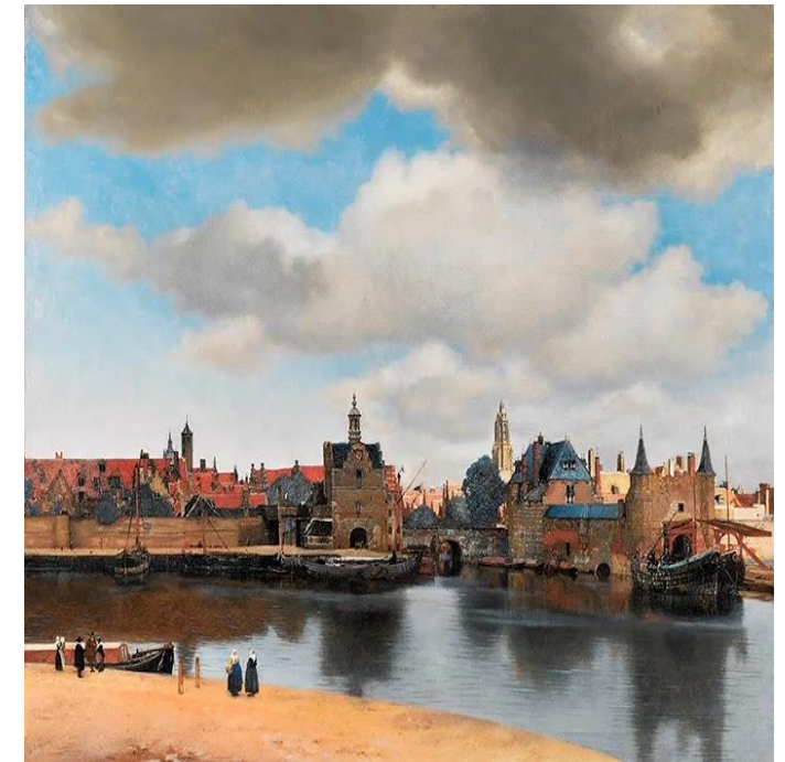
View of Delft(1660-1661)

Boy with a Basket of Fruit and View of Delft are two different paintings from two different artists. What I notice just like Girl with the Pearl Earring, the Boy with a Basket of Fruit takes place inside and View of Delft takes place outside because the background of View of Delft's background shows a blue sky with clouds and Boy with a Basket of Fruit shows the boy somewhere in a dark and grey room. Another thing I notice is that View of Delft represents peace, freedom, and no fear from winning the 80-year War to fight while the Boy with a Basket of Fruit doesn't show that, instead it shows sadness and a bit of fear from the black death also known as the plague which means View of Delft represents happiness and peace and Boy with a Basket of Fruit shows sadness, hopelessness, and fear.