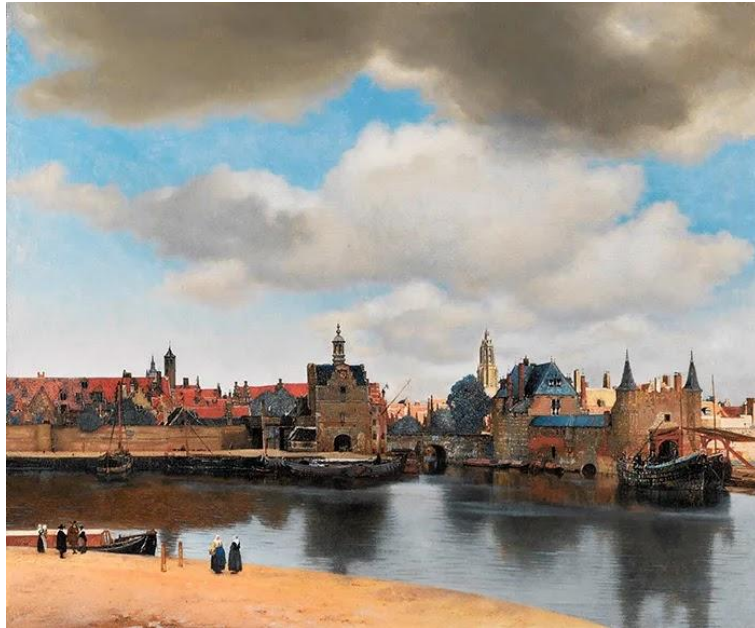
View of Delft (1660-1661)

https://colourlex.com/project/vermeer-view-of-delft/