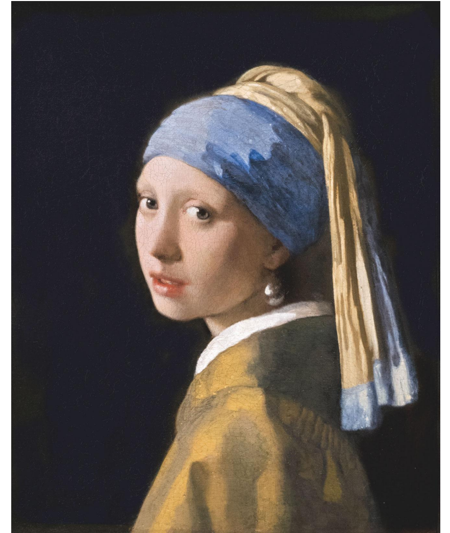
Girl with a Pearl Earring (1665)