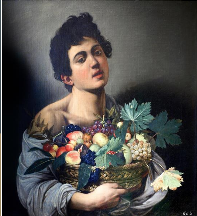
Boy with a Basket Of Fruit (1593)

https://www.wikiart.org/en/caravaggio/boy-with-a-basket-of-fruit-1593-1