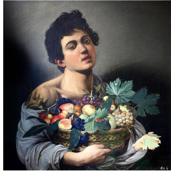
Boy with a Basket of Fruit (1593)

My study is focus on 3 artwork from 2 different artists. The 2 paintings are, “Girl with a Pearl Earring” and “View of Delft,” from Johannes Vermeer,” and “Boy with a Basket of Fruit” by Caravaggio. Within these pieces I will be comparing and contrasting the cultural significance and the personal expression such as the theme, movement, and influences of the artists. I will also be comparing and contrasting 2 of my artwork with the 3 paintings.