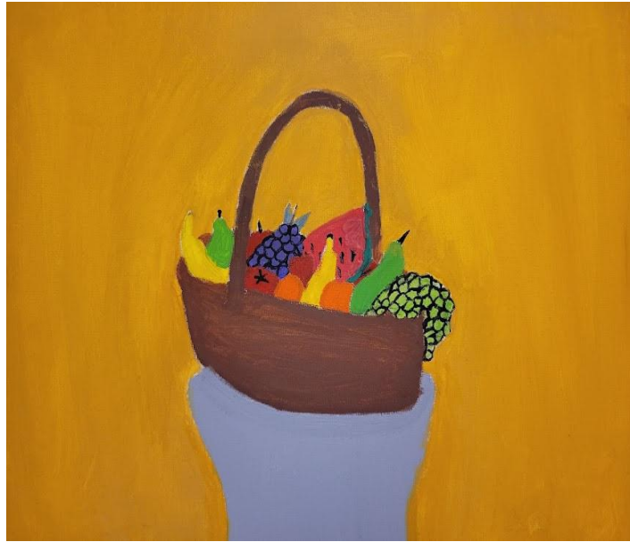
Pillar Fruit Basket (2021)

https://love2justin.weebly.com/project-1-pillar-fruit-basket.html