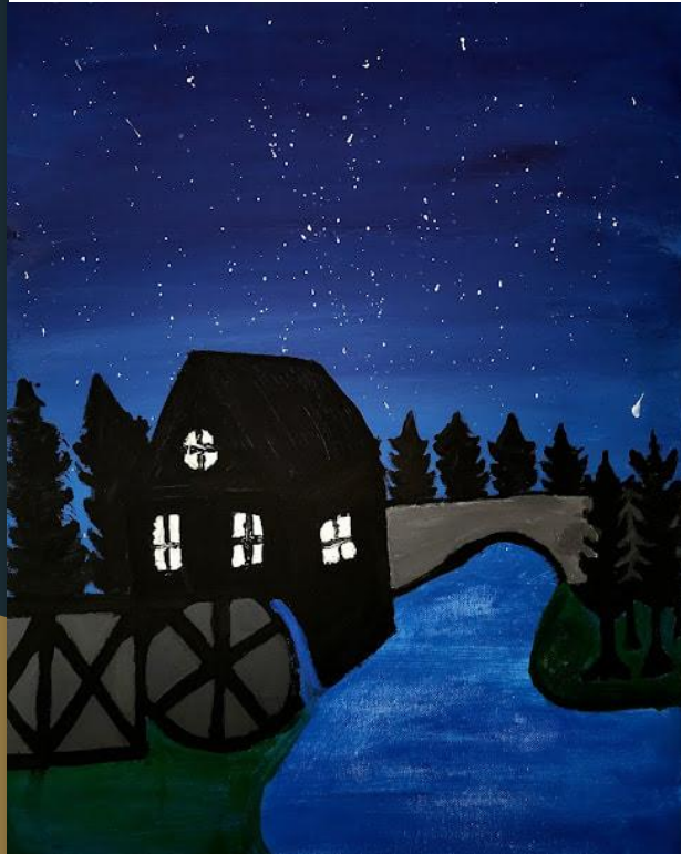
Starry forest (2021)

https://love2justin.weebly.com/project-4--nightscape-painting.html